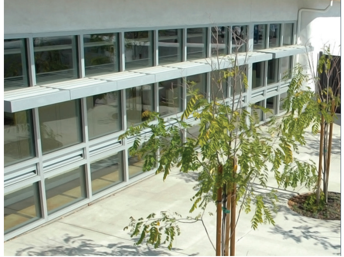
Visalia Police Substation – District 1 Visalia, California ARCHITECT Indigo | Hammond + Playle Architects, LLP, Davis, California GLAZING CONTRACTOR The Glass Shop Inc., Visalia, California